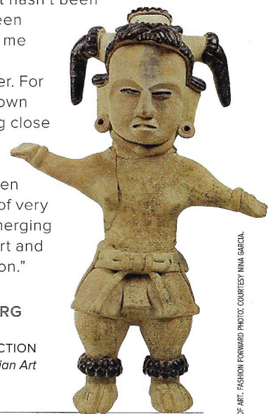
HEADSHOTS: COURTESY DESIGNERS; CURATOR PHOTO: REMONDJAS; CULTURE 300-1100 MEXICO, STATE OF YUCATAN; GIFT OF FREDERICK R. REASANTS; COURTESY TUCSON MUSEUM OF ART; FASHION FORWARD PHOTO: COURTESY NINA GARCIA.

ON PERMANENT COLLECTION Pre-Columbian Art